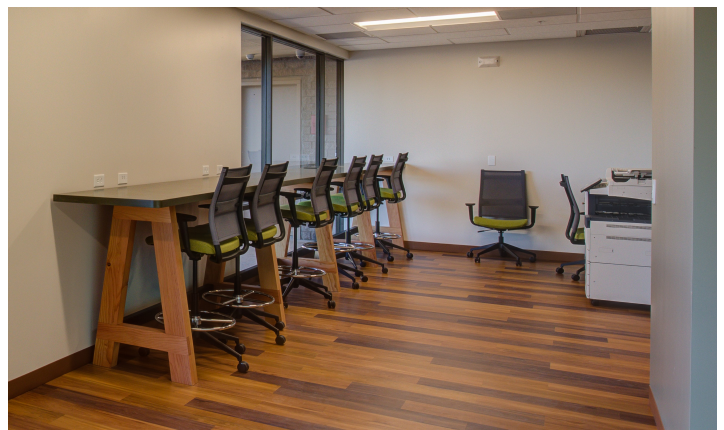
Drop In Bar