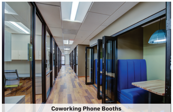
Coworking Phone Booths