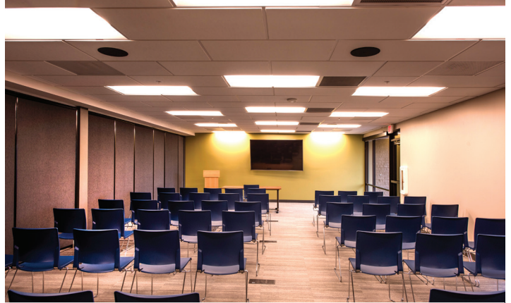
Large Conference Room A