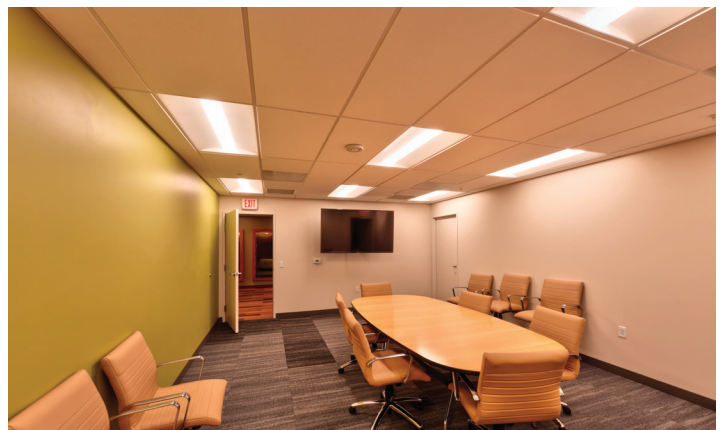
Small Conference Room