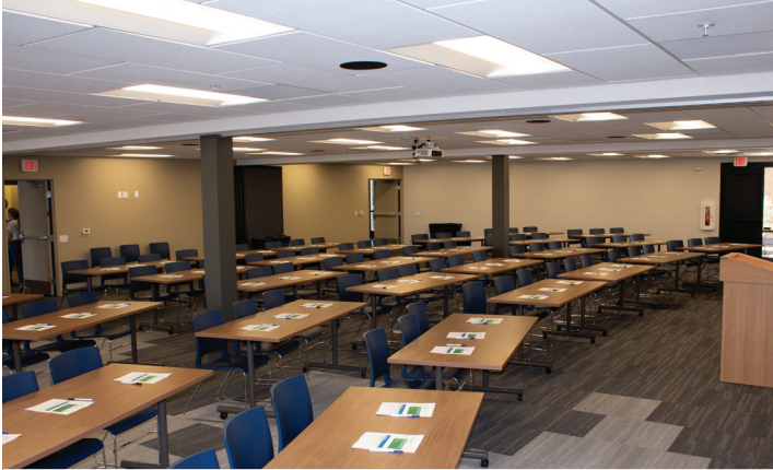
Large Conference Room A, B, C