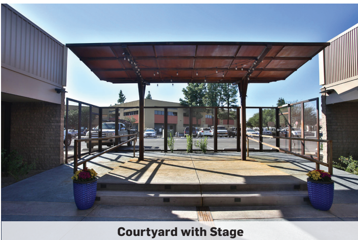
Courtyard with Stage